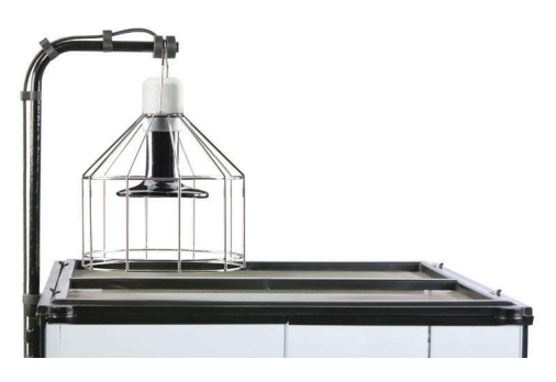
The Ceramic Heater is to be used only with the specially designed Exo Terra Wire Light.